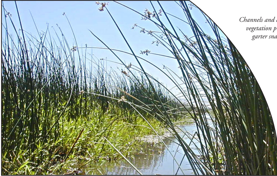
Channels and ditches bordered by marsh vegetation provide part of the giant garter snake's habitat needs