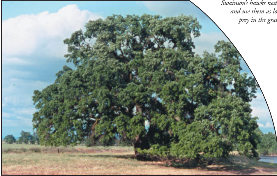
Swainson's hawks nest in tall trees, and use them as lookouts for spotting prey in the grasslands below.